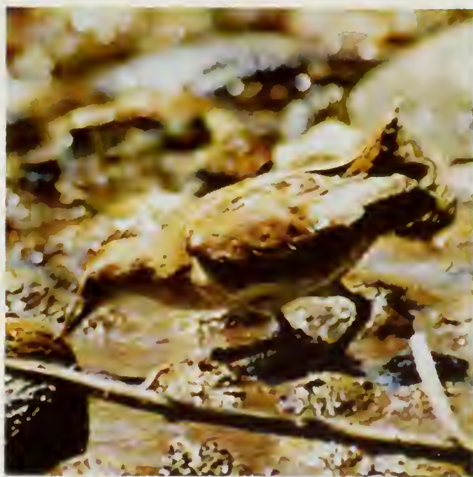
Figures 1–2. Little Crake / Marouette poussin Porzana parva , Cousin Island, Seychelles, December 2004 (Cas Eikenaar)